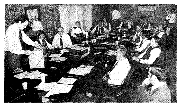
Our Regional Sales Managers were in Mishawaka for a review and critique of '77 performance and to firm up the Marketing Plans and activities for 1978.